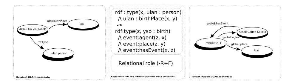
Fig. 2. An example of a metadata explication.

Figure 2 illustrates an example of the metadata schema explication. The left side of the figure shows a part of an original metadata description from the ULAN dataset of the Getty Foundation. The relation birthPlace is first classified using the rigid and foundedness criteria and resolved to be a relational role. The explication against the event-based knowledge representation schema is made using the YSO [12] domain ontology. An explication rule where the instance of a perduring concept birth is related to the place of the birth using thematic role place , is derived. Finally, the right side of the figure shows the resulting event-based metadata.